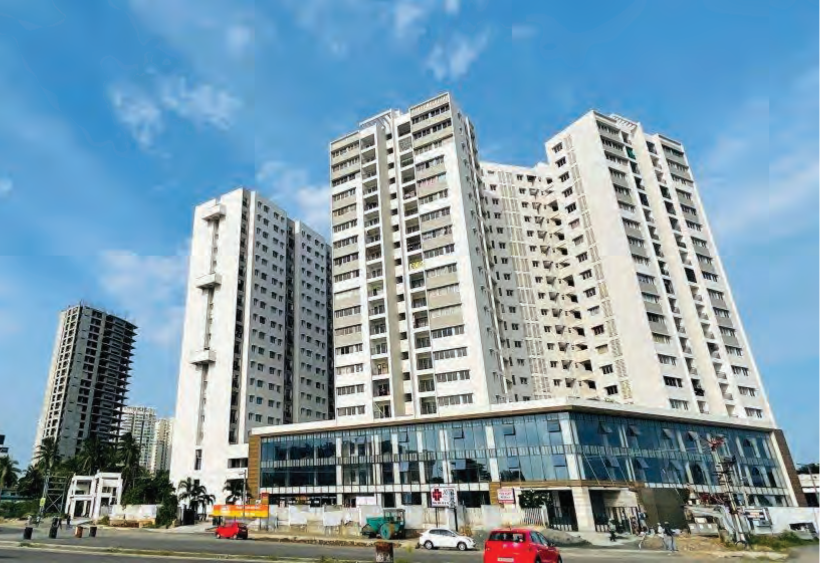
Godrej SSPDL AZURE Residential Project at Kalipathur, OMR, Chennai